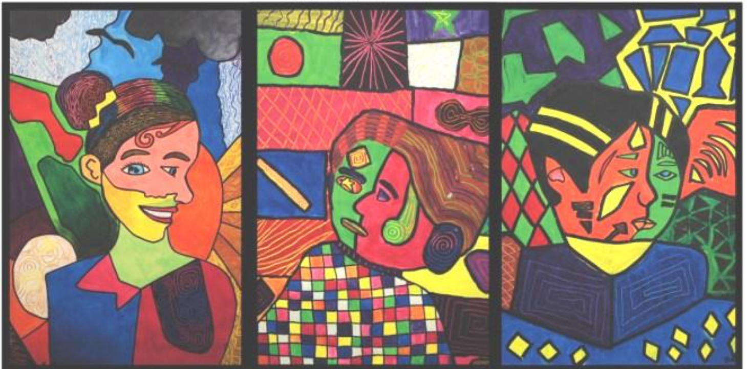
Year 8 Picasso Paintings